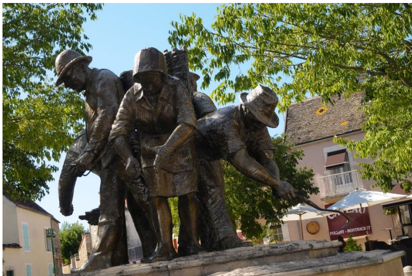
Monument Square - OTI@I&A