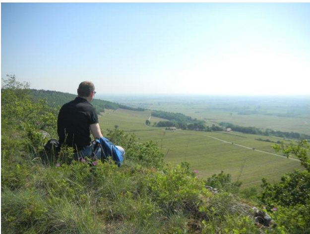
View on the of Roche Dumay