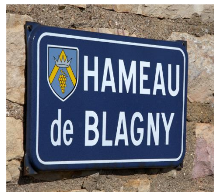
Village of Blagny

Then turn left towards the small pine wood. Reaching the tarmac road, turn left 11 and then, in 20 m, left again 12.