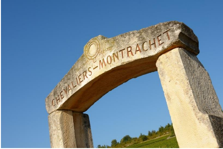
Grand Cru "Montrachet" - OTI@I&A