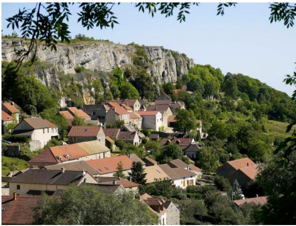
Orches – OTI@Image&Associés