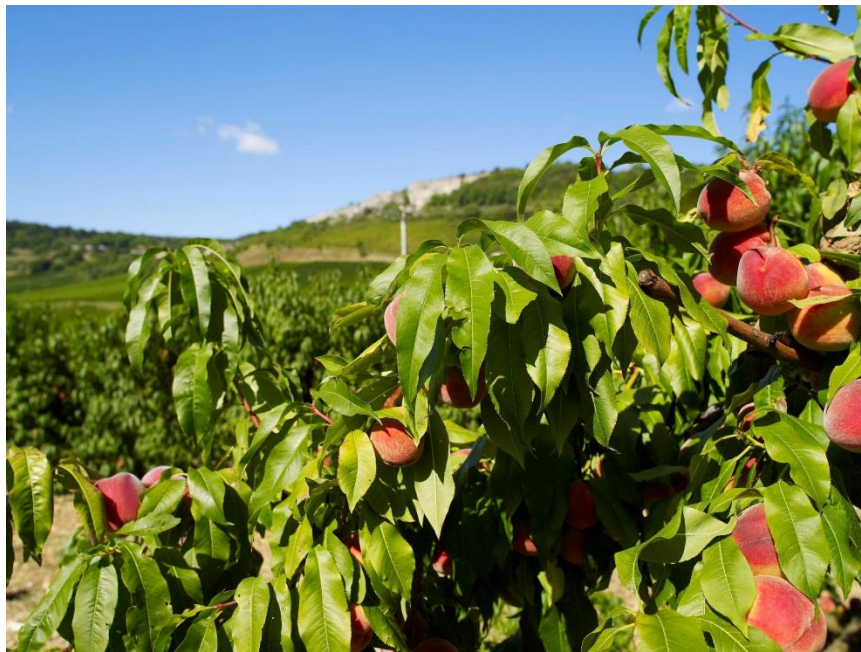
Hautes Côte de Beaune - OTI@I&A

11 - Orientation table to give free rein to your imagination.