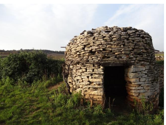
Dry stone buildings: "Cabotte"

RESPECT THE HARVEST AND PLANTING. DO NOT LEAVE LITTER.