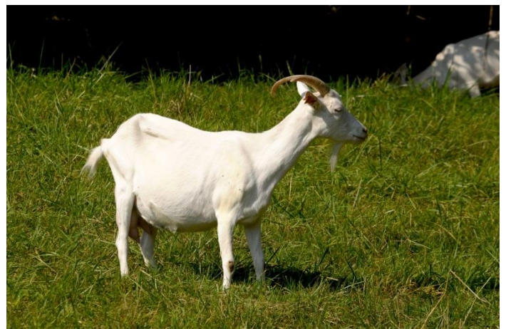
The famous "bique" (goat)

3 - Battaut Farm: set of recently renovated buildings. The estate was bought in the late 12 th century by Mathilde, Duchess of Burgundy, and given to Tart Abbey, located 12 km from Cîteaux (it was the first congregation of nuns of the Cistercian order, the Bernardines).