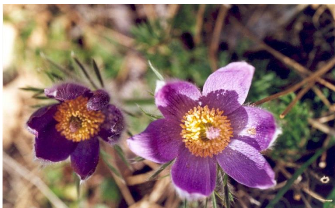
Anemones Pulsatiles