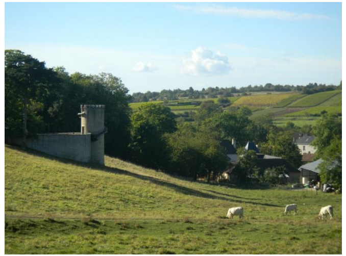
Old "racetrack"

slightly to the right along the edge of the field. Continue climbing into the woods. At the bend, ignore the track heading down to the right and continue slightly left on the path into the pines. Climb uphill along the motorway fence. Reaching a bare embankment near the motorway, turn right onto a wide metalled path. At post P99, turn immediately right (red and white markings of the GR® 76) on a large metalled path through the pines.