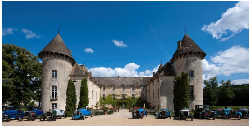
Château de Savigny

Cross the Rhoin (old wash-house on the left) and go straight along the boundary of the Château 9.