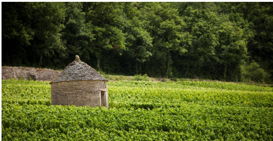
Little stone hut known as « Cabotte »

RESPECT THE HARVEST AND PLANTING. DO NOT LEAVE LITTER.