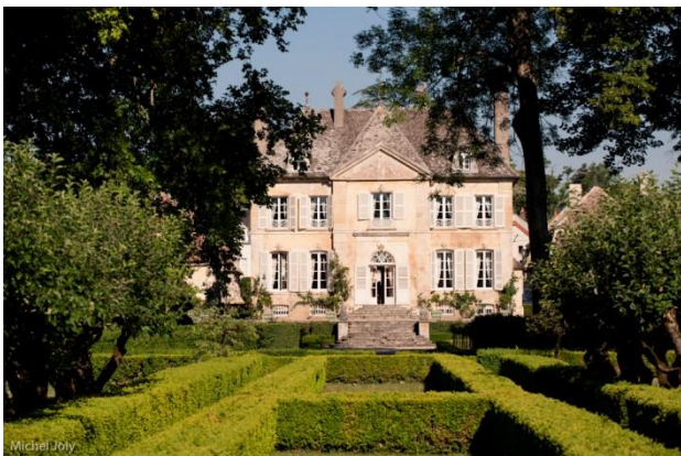
Manoir « Chandon de Briailles » ou « de Nicolay »

Take the first metalled path on the left, then left again to enter the forest. The path is bordered to start with by numerous "meurgers" 3 .